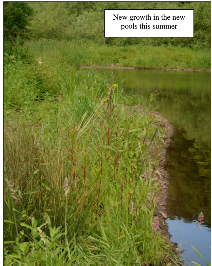
New growth in the new pools this summer

The preferred method at Dibbinsdale is cutting, strimming and pulling. The plant must be cut close to the ground, below the lowest node or it will re-grow and flower later in the season. Cutting should be carried out no earlier than mid June to prevent rapid re-growth to the flowering stage and possible increase in seed production. Cut or pulled plants can be safely left on site to decompose.