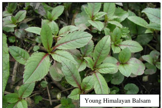
Young Himalayan Balsam

Other native wetland plants, brought from other areas of the reserve, will be brought here in the months ahead. It will act as a positive focus of wetland conservation. ‘Nature abores a vacuum’ is a phrase well known to gardeners and conservationists alike.When established, the native wetland plants will not be so threatened by our more exotic ‘aliens’. That’s the theory, anyway !