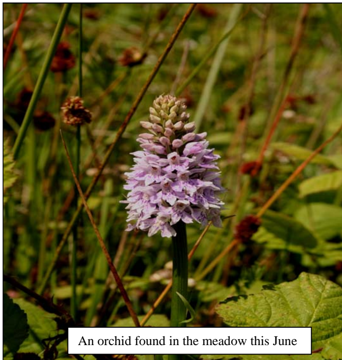
An orchid found in the meadow this June

Not only is the third meadow cut being undertaken, part of Countryside Stewardship, as we are going to print, but the meadow is looking very good. The idea in cutting it (and the removal of the grass in bales) is that the meadow will become better for wildflowers (insects, birds and small mammals) because of it. The conservation of the meadow means preserving it as a grassland and maintaining 'biodiversity'. It is a unique and precious habitat that supports its own special types of wildlife. If trees are allowed to develop here, this would be lost. What has been encouraging to see here on the meadow this year is the number of wildflowers associated with grassland putting on a good show. The most iconic of these is the meadow orchid. We thought this had disappeared under a mountain of brambles and thicket. The meadow in early summer has looked splendid with huge clumps of light purple Lady's Smock, followed by the pink Ragged Robin and yellow Birds Foot Trefoil. The variety and the new colours will only improve with on-going management. Dibbinsdale's quiet revolution.