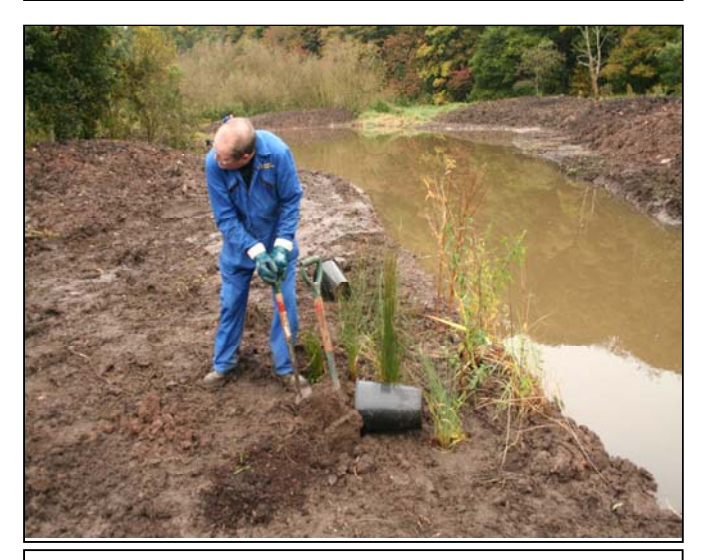
Planting up into the mud. The Pest Control Officers 'sunk' pots of rushes, reeds and other marginal plants on the edge of the new pools

The management of the new pools next year will involve the eradication of Himalayan balsam and the introduction of more useful vegetation. Marginal plants will be transplanted from other parts of the reserve to here. The main plant species will be common reed. These will spread into the pools and provide a very rare habitat for wetland wildlife. Care has been taken to protect the 'toad' pool in this area..