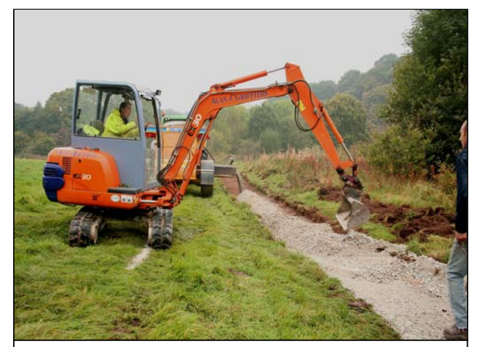
Meanwhile other excavators are putting down path material at the bottom of the meadow