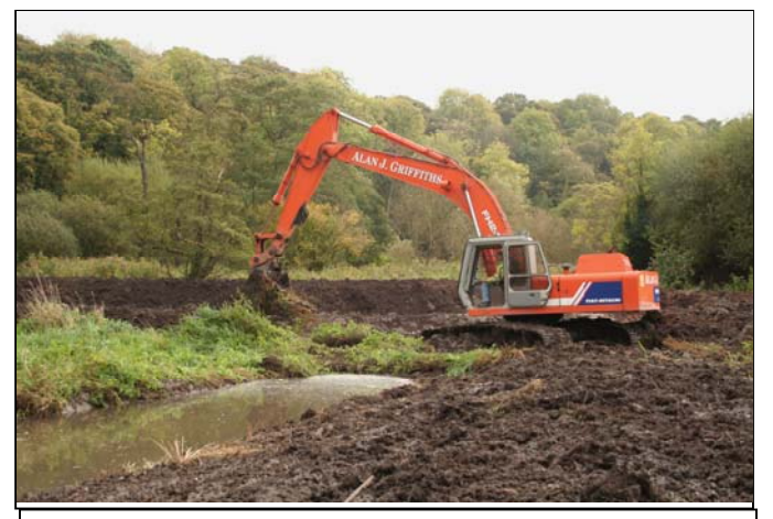
Excavator digging out pools. The dug material raising the banks for water vole burrows

The Pest Control Officers finished off the volunteer conservation task days here splendidly. The plants were dispatched and rehoused by them close to the new pools within days of the contractors job finishing. Result !